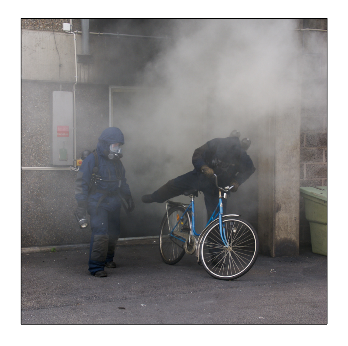
Learning, as well as change, can be painful...