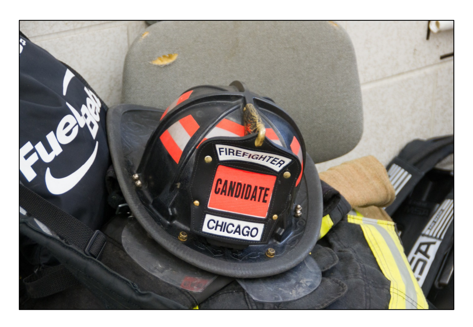
"...that is not how we do it around here..."